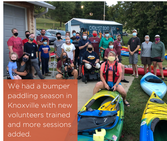
We had a bumper paddling season in Knoxville with new volunteers trained and more sessions added.