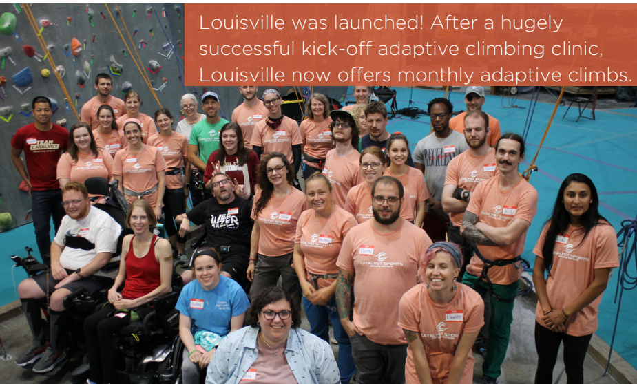
Louisville was launched! After a hugely successful kick-off adaptive climbing clinic, Louisville now offers monthly adaptive climbs.