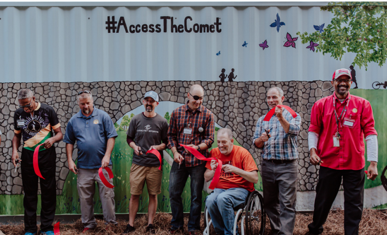
We officially opened the "Bike Barn." Our adaptive cycling hub on the Silver Comet.