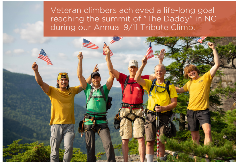
Veteran climbers achieved a life-long goal reaching the summit of "The Daddy" in NC during our Annual 9/11 Tribute Climb.