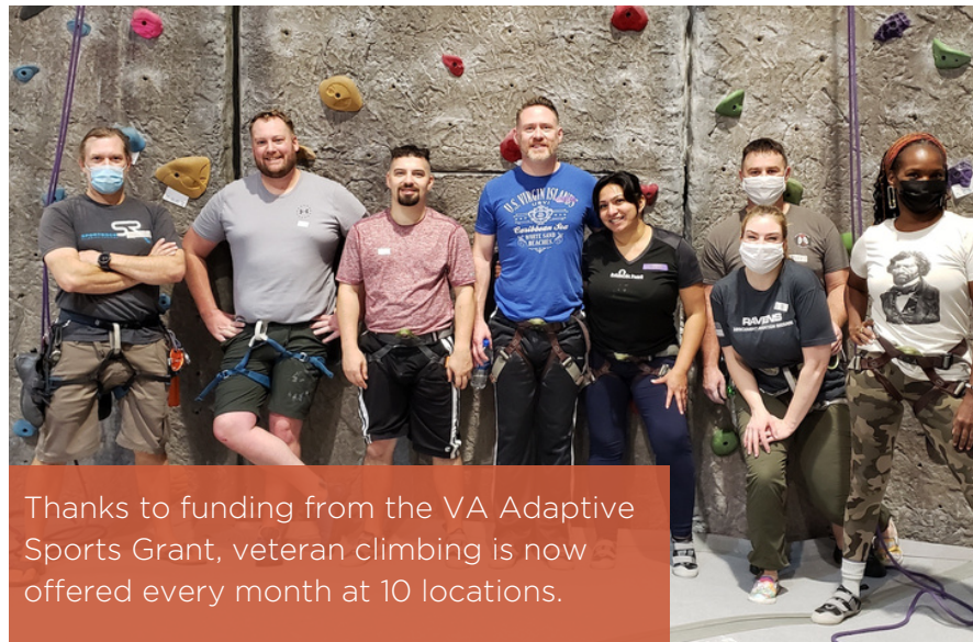
Thanks to funding from the VA Adaptive Sports Grant, veteran climbing is now offered every month at 10 locations.