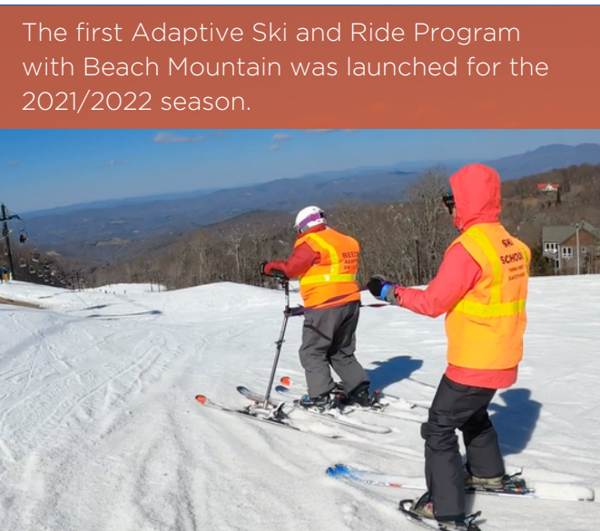
The first Adaptive Ski and Ride Program with Beach Mountain was launched for the 2021/2022 season.