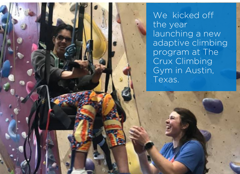
We kicked off the year launching a new adaptive climbing program at The Crux Climbing Gym in Austin, Texas.