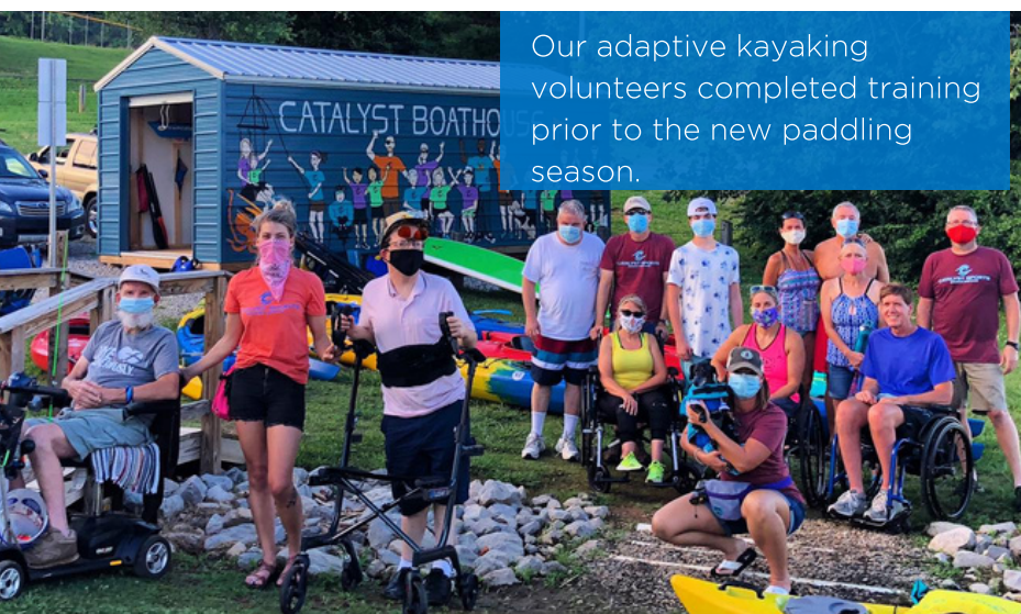
Our adaptive kayaking volunteers completed training prior to the new paddling season.