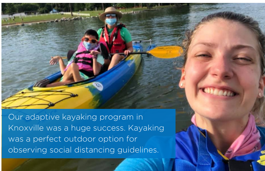
Our adaptive kayaking program in Knoxville was a huge success. Kayaking was a perfect outdoor option for observing social distancing guidelines.