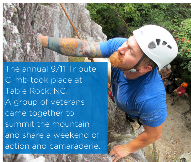
The annual 9/11 Tribute Climb took place at Table Rock, NC. A group of veterans came together to summit the mountain and share a weekend of action and camaraderie.