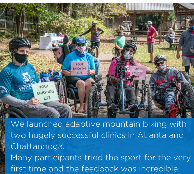
We launched adaptive mountain biking with two hugely successful clinics in Atlanta and Chattanooga. Many participants tried the sport for the very first time and the feedback was incredible.