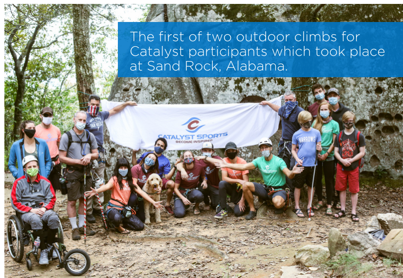
The first of two outdoor climbs for Catalyst participants which took place at Sand Rock, Alabama.